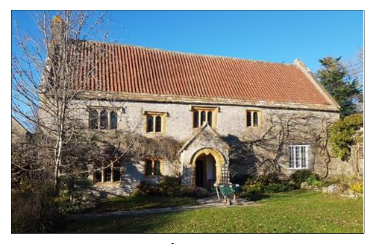
2pm to 4 pm – Monday 24<sup>th</sup> February – Kilve Village Hall Refreshments will be served

Website <a href="https://quantock.u3asite.uk/">https://quantock.u3asite.uk/</a>