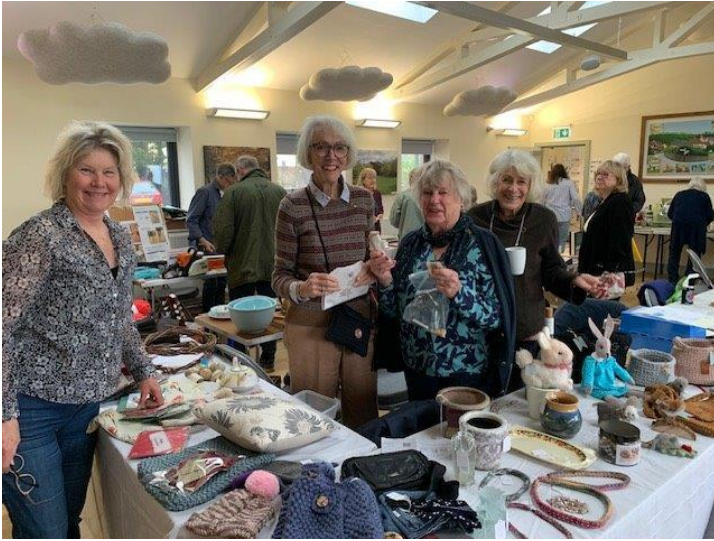
Table Top - Good as New Sale Holford Village Hall

This event took place on Saturday 21 st October in the Holford & DVH, proceeds from the admissions, raffle, the Holford PCC cakes and bargain stall and general table hire came to a grand total profit of £340.05 helping to boost funds for Holford church.