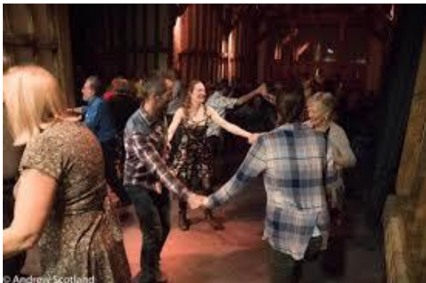
steps - then you're off!

FREE entry but you must have a ticket: limited numbers for Health & Safety reasons - so make sure you get yours when they become available. Licensed bar.