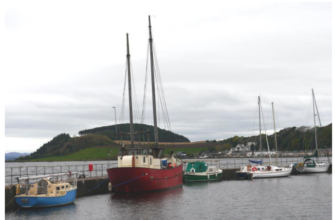
Avoch Harbour, Black Isle

After a 2 night stay in Strathpeffer (near Inverness) we were due to go to a cottage by Loch Carron on the west coast. Three days into our Tigh Mor stay it transpired that the booking agency had withdrawn the property because of various problems with it – communication to us was sadly lacking to put it mildly! With limited Wi-fi we had to try to find alternative accommodation. Very disappointedly there was nothing suitable on the west coast and we had not been on that side for many years.